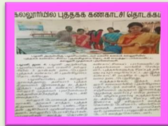
Book Exhibition News Paper clippings