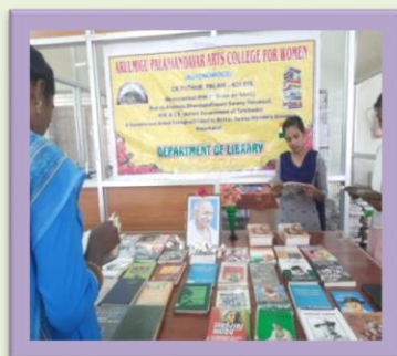
Gandhi Jayanti Calibration