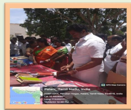
75 th Independence Day calibration- exhibition of rare books (Year 1900- 1965) and Freedom fighters Books