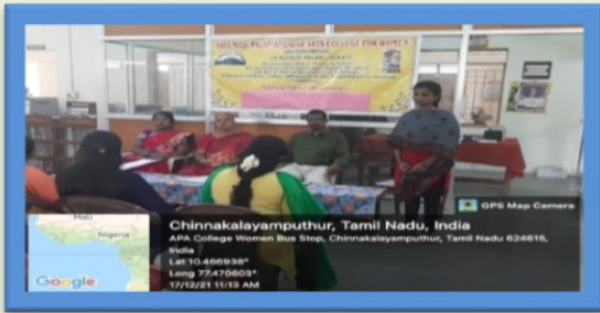
National Library Week Calibration