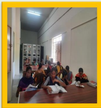
Competitive Exam Corner