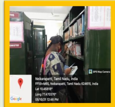
Open Access system