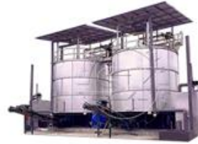
in vessel composter