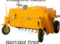
moving type compost turner