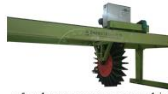
wheel type compost machine