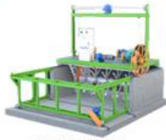
groove type compost turner