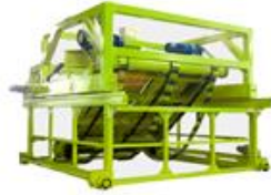
chain plate type compost turner