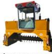
crawler type composter